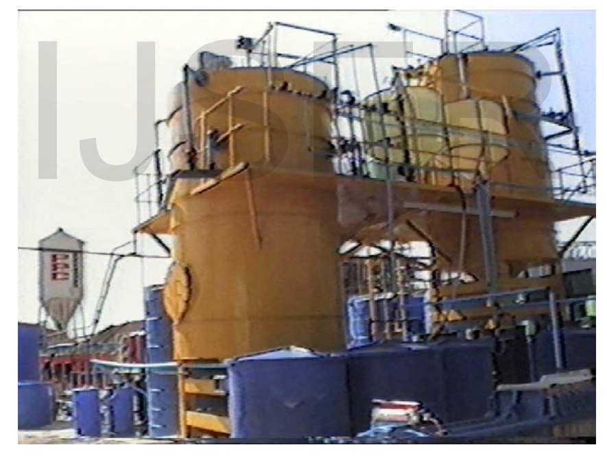
Figure 1. General view of the pilot plant.

For the testing of the technology developed and manufactured pilot plant. The pilot plant comprises a water treatment, desalination unit, the crystallization unit and automatic control system. General view of the pilot plant is given in Figure 1.